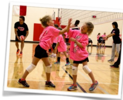
Bring A Friend (BAF™)