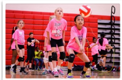
Skills Contest / PLAYDAY